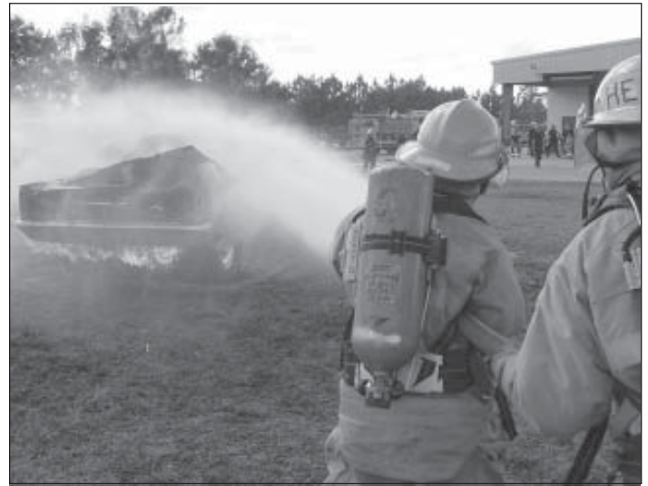
Students deal with real-life situations at the Fire Academy – in this case, a car fire.